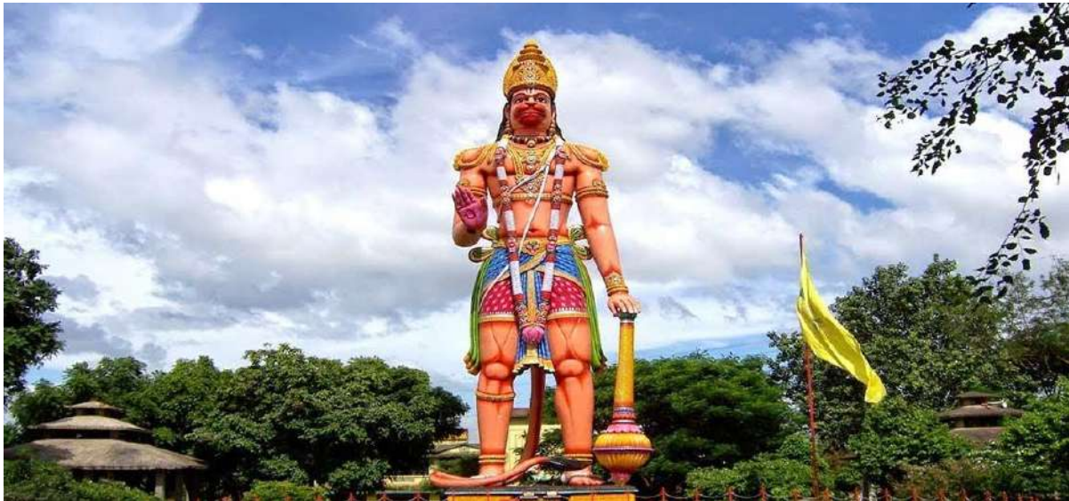
The Hanuman Vatika statue in Rourkela.

Located 300km north by north-west of Bhubaneswar lies the city of Rourkela. The history of the city is intertwined with India's first public sector steel plant. The Steel Authority of India (SAIL) set up the plant in the 1960's with the help of German conglomerate Krupp and Demag. Since then, Rourkela has kept with modernization and grown to become one of Odisha's best planned and picturesque cities. As a whole Rourkela is perfect confluence of a city living and a nature retreat.